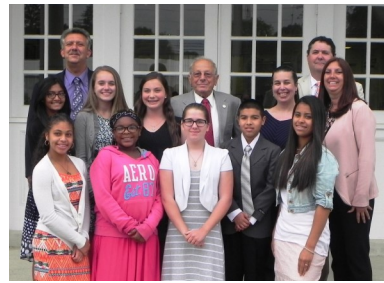
2015 Deerfield Township Youth Officials conducted Youth Township Committee and Recreation Committee meetings in June at the municipal building.

Cumberland County residents utilizing the Solid Waste Complex or convenience centers in the townships of Deerfield, Downe, Hopewell, Lawrence, Stow Creek and Upper Deerfield are required to keep vehicles in compliance. Vehicles found to be in violation of the law may be issued a summons by the Cumberland County Solid Waste Enforcement Unit or by the state, county, and municipal law enforcement officials.