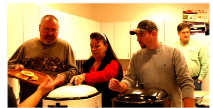
Recreation Committee and volunteers make and serve breakfast and take a photo with Santa.