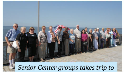
Senior Center groups takes trip to Charlesworth this past summer.