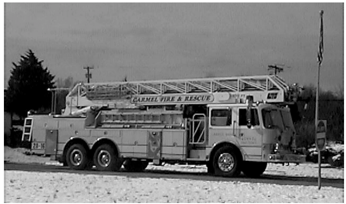
Carmel Fire Company Adds Ladder Truck to serve Deerfield Township and other communities.