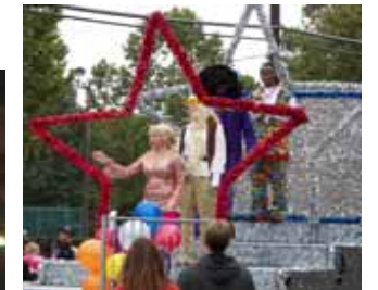
The parade held on Saturday for the time included costumed characters and professional floats.

"On behalf of the Township Committee and all the people of Deerfield Township and the thousands of people who attend the festival, I thank the recreation committee members, harvest festival volunteers and everyone who helps make this event such a big success and a source of unity and pride for our community."