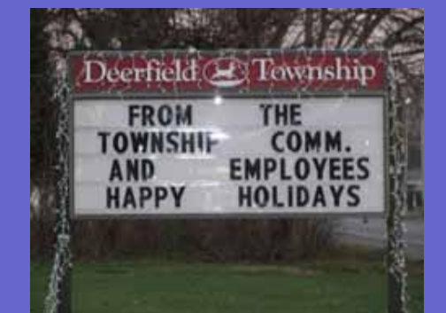
"On behalf of the Township Committee, I wish everyone a holiday season filled with happiness and peace."

Residents must obtain a permit from the Township Clerk's office for all yard sales. There is no fee for the permit. Yard sales may not exceed 2 consecutive days and may not be held during the Harvest Festival weekend.