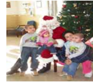
More than 100 children and adults enjoyed breakfast with Santa.