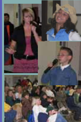
Idol Contest preliminary show was held inside Rosenhayn Fire Hall on Friday night. (above) Idol finalists appeared in the parade on Saturday and in the final show on Sunday.