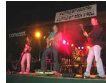
Popular national country music stars "Ricochet" thrilled thousands on

200 people packed the Rosenhayn Fire Hall on Friday night as part one of the Idol Contest moved indoors due to the wet grounds in Frank Lo-Biondo, Sr. Park.